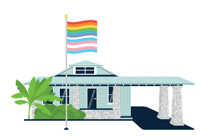
OUTMEMPHIS COMMUNITY CENTER 892 Cooper Street