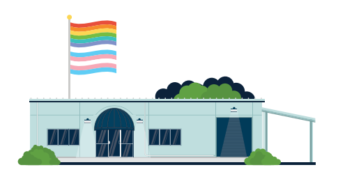
ADMIN & DONATION CENTER 832 Virginia Run Cove