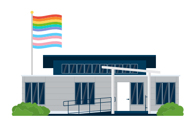
YOUTH EMERGENCY CENTER 2055 Southern Avenue